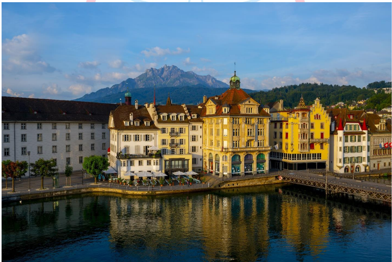
Lucerne Old Town (Altstadt)