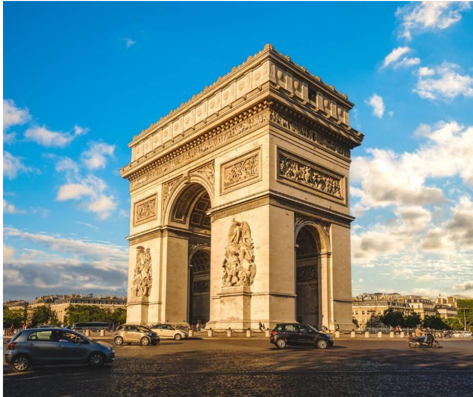
Arc de Triomphe, Paris

Finally, we head to the Champs-Élysées , the heart of Paris, where you see the essence of Parisian culture through theaters, cafes, luxury shops and the beautiful city lights.