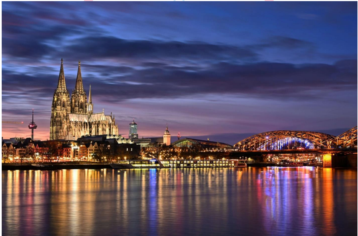
Cologne Cathedral, Germany