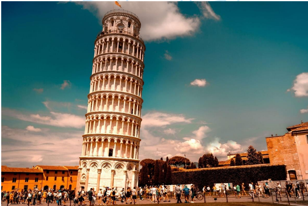
Leaning Tower of Pisa, Italy