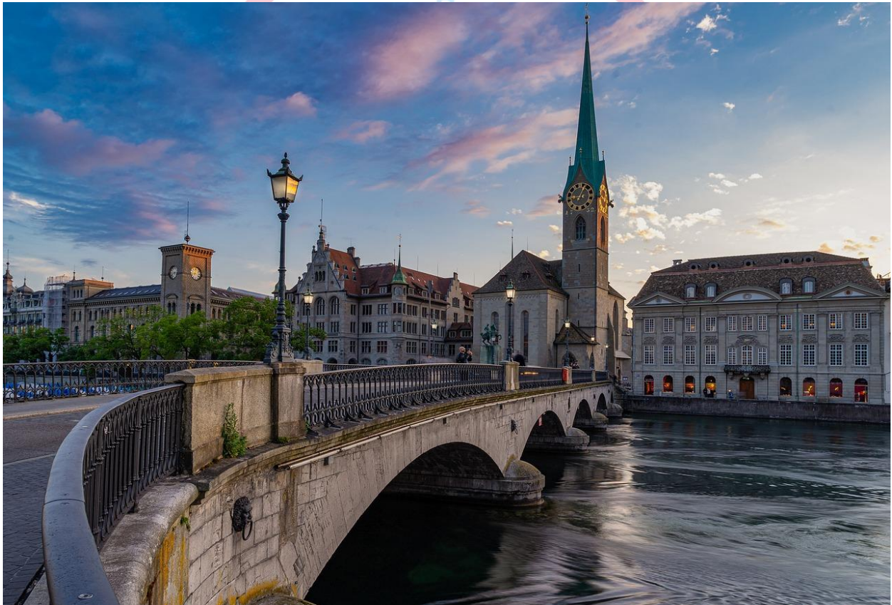
Lake Zurich, Switzerland

We head to Lake Zurich , where the cool breeze of the mountain air, the calm waters, and the view of the distant Alps gives a moment to indulge in this experience.