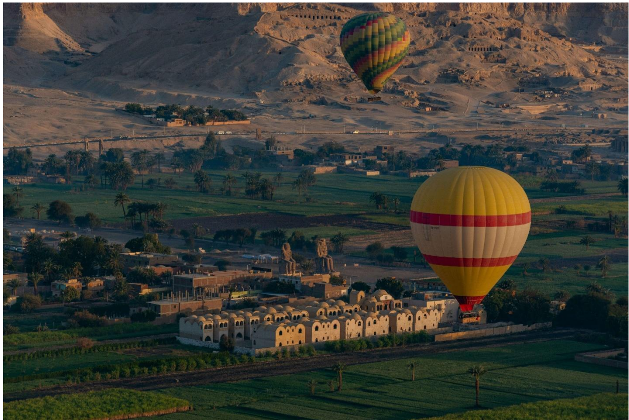
Luxor Hot Air Balloon Ride

The following morning, set off on a memorable hot air balloon journey above the West Bank of the Nile. Here, beneath the golden sands, rest the tombs of kings and queens.