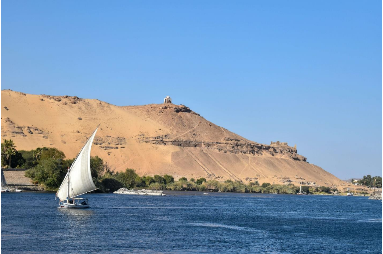
Felucca ride on the Nile, Aswan

Take a morning flight or an overnight sleeper train to Aswan, where you can experience Nubian culture and breathtaking scenery. Visit the Philae Temple , a charming sanctuary devoted to Isis, reachable only by boat. Afterward, take an hour to stop at the Unfinished Obelisk and observe an ambitious ancient endeavor that has been frozen in time.