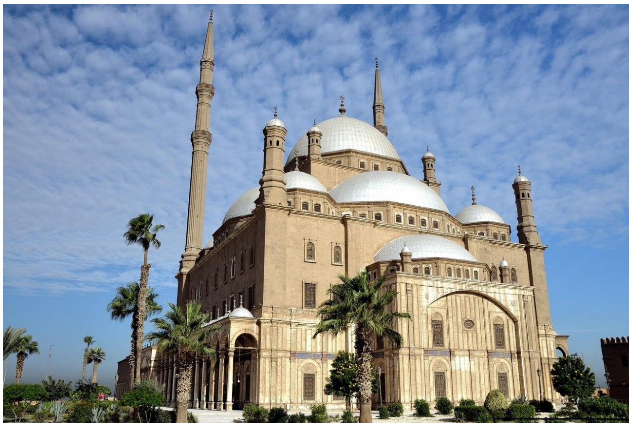
Mosque of Muhammad Ali, Cairo