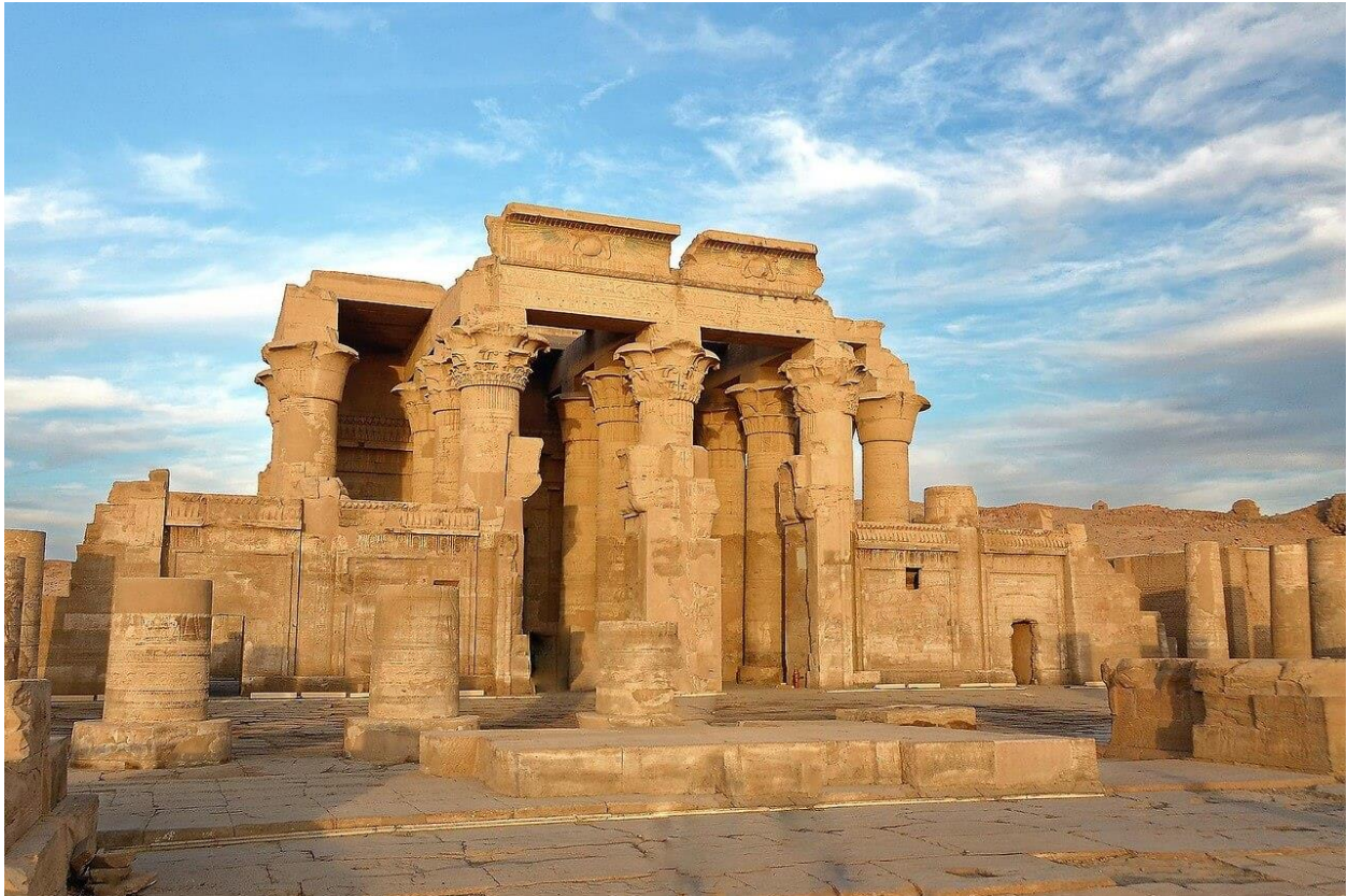
Kom Ombo Temple

As you embark on your journey to the Kom Ombo Temple , a unique double temple honoring Sobek (the crocodile god) and Horus, awaken to the gentle sway of the cruise. Also explore the Crocodile Mummy Museum .