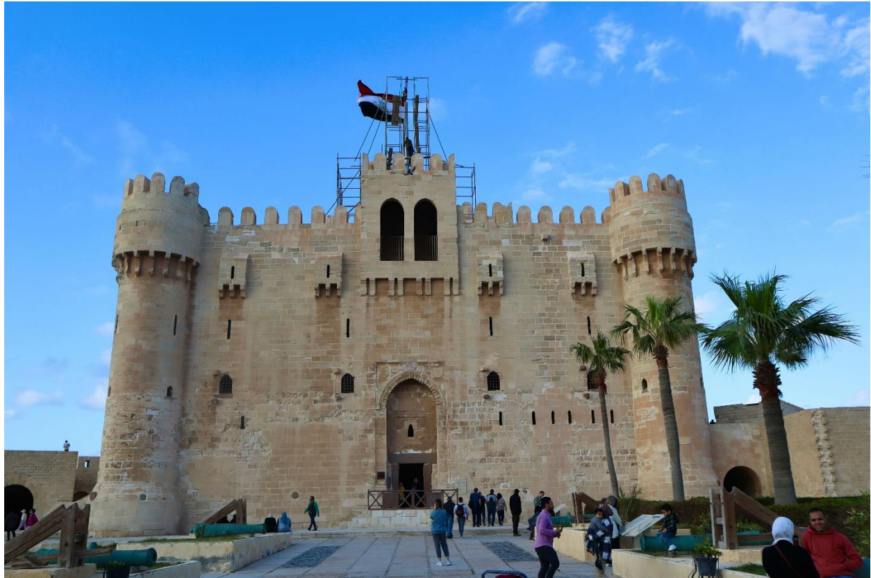
Citadel of Fort Qaitbey, Alexandria

Citadel of Qaitbay , a fortress built from the remains of the Lighthouse of Alexandria.