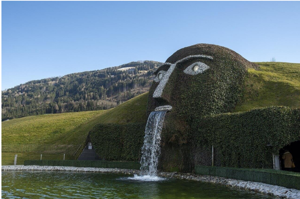
Swarovski Crystal Worlds Head

After breakfast, head to Wattens, where art, light, and design come together in stunning harmony, spend the morning enthralled with Swarovski Crystal Worlds . Later, see surreal views as you ascend the Nordkette Mountain Range on the Hungerburg Funicular .