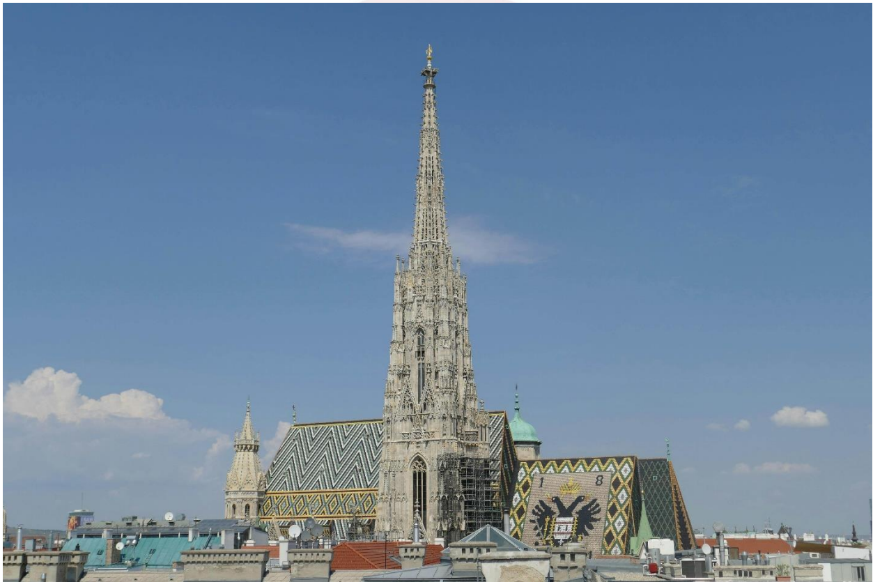
Seville Cathedral, Seville

Enter a fantasy world as you discover Austria's most enchanted locations, such as the royal palaces of Vienna and the charming alpine town of Innsbruck. Explore the lakes, mountains, and Sound of Music moments in Salzburg, cruise the picturesque Danube Valley, and stroll through Schönbrunn, Belvedere, and the Hofburg. Discover the magical village of Hallstatt, and finish your trip with breathtaking views of the mountains and glistening artwork at Swarovski Crystal Worlds. Every day offers the ideal balance of beauty, history, and enduring appeal.