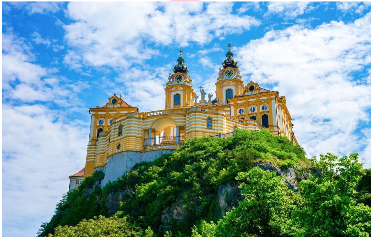
Melk Abbey, Danube

After breakfast, take a full-day tour across the Danube Valley's picturesque surroundings. Explore medieval villages, sample regional wines, and pay a visit to the magnificent Melk Abbey , which is situated high above the river. Enjoy a peaceful boat ride along the Danube River in the summer or an old-fashioned