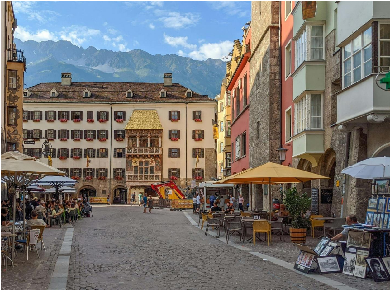
Golden Roof, Innsbruck

After breakfast, take a train in the morning to Innsbruck, which is surrounded by tall peaks. Explore the ancient Old Town , take in the splendor of the Golden Roof [30 minutes], and enter the splendor of the Renaissance at Ambras Castle .