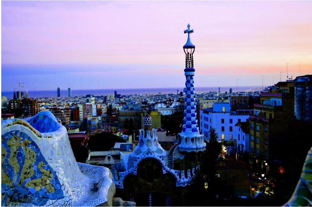
Casa Batlló, Barcelona

Next, head to Casa Batlló that Gaudi designed in a blend of nature and art with its unique interior spaces, wavy balconies and the windows that together look like foaming seas, and its unforgettable architecture. If you want to shop at upscale stores, then Passeig de Gràcia is the way to go.