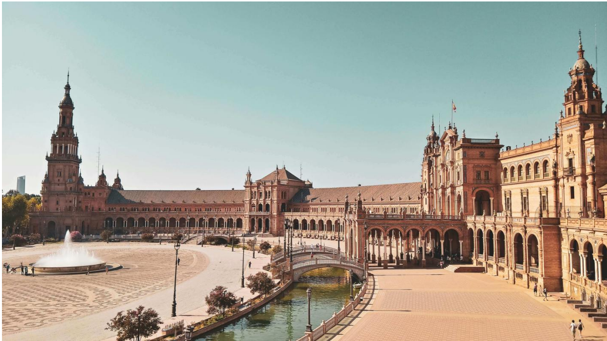
Plaza de Espana, Seville

After breakfast, take a high-speed train to Seville. Take a taxi to the magnificent Alcázar Palace , which combines Spanish and Islamic architecture. After that, explore Plaza de España , one of Spain's most picturesque sights, and take in the park's surroundings as the sun sets.