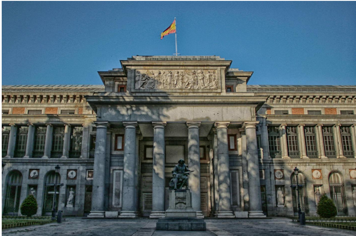
Prado Museum, Madrid

Full from breakfast, spend the day exploring Madrid and its magnificent Royal Palace , the Spanish kings' royal residence. Enjoy the Prado Museum , which has works by Goya, Velázquez, and other artists. As the sun climbs higher, wander through the historic heart of the city to the grand Almudena Cathedral , with its peaceful crypts and sweeping views from the dome.