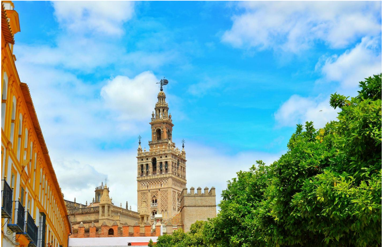
La Giralda Tower, Seville

After breakfast, climb the La Giralda Tower for sweeping views and visit the famous Seville Cathedral . To complete your Seville experience, enjoy a flamenco show in the evening.