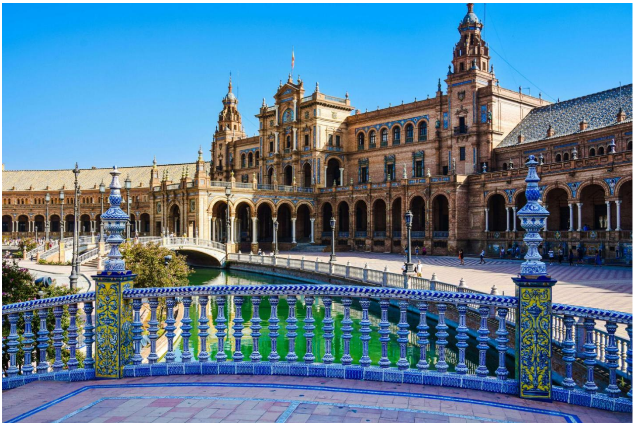
Seville Cathedral, Seville

A Spain Tour is diving into a land where vibrant current life and timeless heritage meet in a most spectacular way. Every moment here seems like something from a dream, from the opulence of royal palaces to the flaming passion of flamenco.