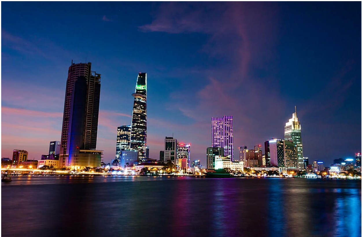
Ho Chi Minh City

After breakfast, we fly to vibrant Ho Chi Minh City . Explore the major landmarks that write Vietnamese history, like Reunification Palace , a historic government building; Notre Dame Cathedral , a French-colonial church; War Remnants Museum , with exhibits of the Vietnam War; Chinatown , and Ben Thanh Market . This day is a blend of modernity and colonial experiences.