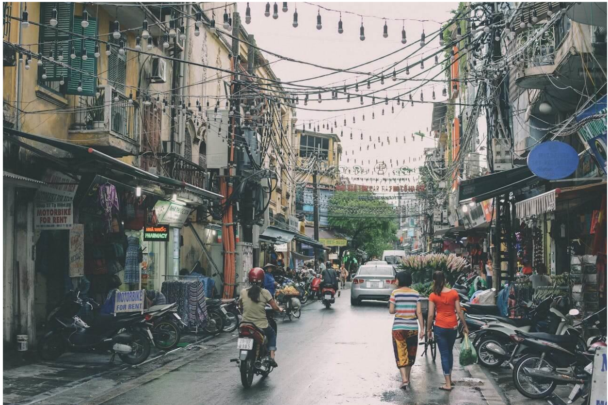
Hanoi Old Quarter

Full from breakfast, we go on a walking tour around the legendary Hoan Kiem Lake and the bustling Old Quarter . Explore Tran Quoc Pagoda , one of the oldest lakeside Buddhist temples in Vietnam, and the ancient Taoist temple, Quan Thanh Temple . Enjoy the diverse cultural exhibits of Vietnam's 54 ethnic groups at the Museum of Ethnology . Visit the Temple of Literature , Vietnam's first national university, and a tribute to Confucius with its Confucian architecture.