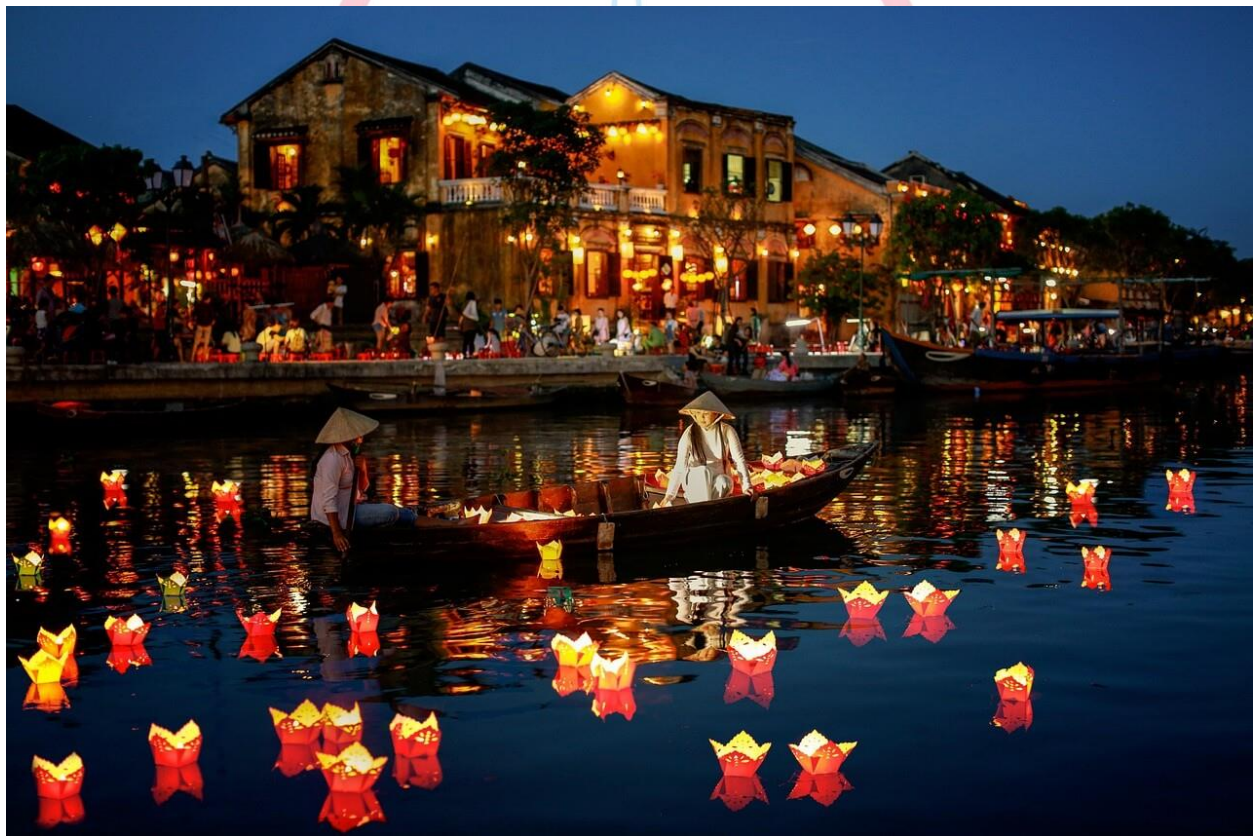
Hoi An Night Market Evening Lanterns