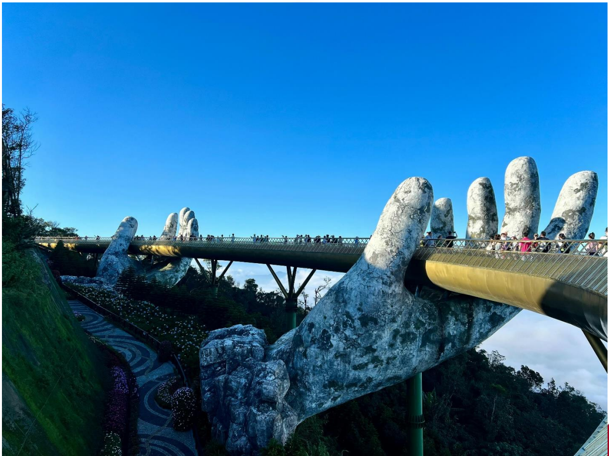
Golden Bridge, Ba Na Hills

A captivating 8-day Vietnam Tour is waiting for you with its iconic destinations. From the buzzing energy of Hanoi to the mystical beauty of Halong Bay, the imperial elegance of Hue, and the romantic, lantern-lit charm of Hoi An as well as the famous Golden Bridge in Ba Na Hills. Vietnam offers a journey that's as soulful as it is scenic. Each stop draws you into a unique world where rich history, vibrant culture, and breathtaking landscapes come together in unforgettable ways. Hop onto a cruise along the Mekong Delta, tap into the Cu Chi tunnels, and enjoy its secret tunnels, feeling like a detective in action, all the while diving deep into Vietnam's diverse heritage. All in just one week!