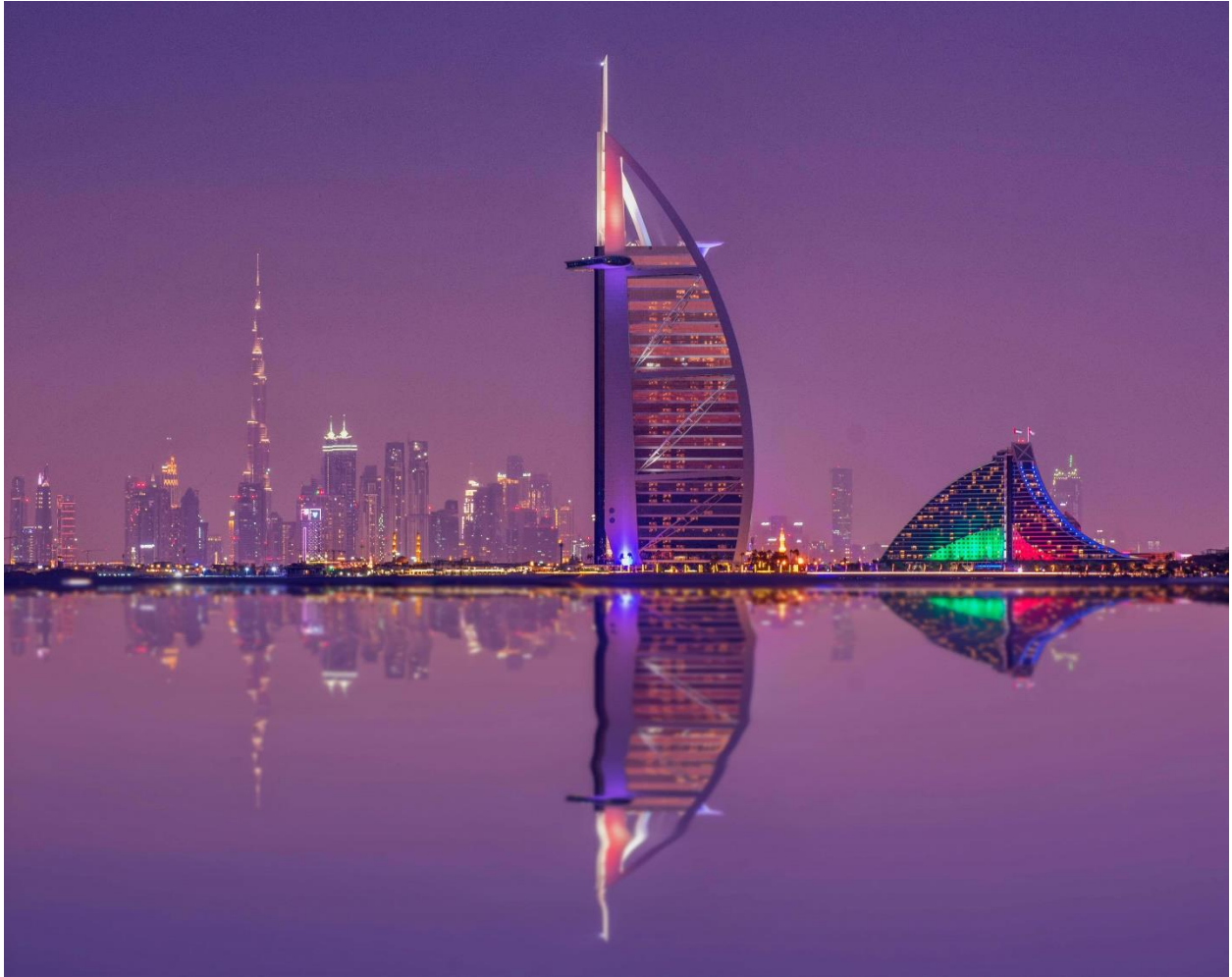
Burj Al Arab and the night city view

Full from breakfast, begin Dubai City Tour. Photo stop in Burj Al Arab , visit Jumeirah Mosque . Bask in the traditional Emirati architecture in Al Fahidi Historical District , take some photos at Dubai Creek and cross the creek in a local water taxi 'Abra'. Explore the hustle and bustle of the Gold Souk & Spice Souk to have an authentic local Dubai experience. Check out the world's tallest building, Burj Khalifa , an 828 m high, 163 floors tall building, and take pictures there.