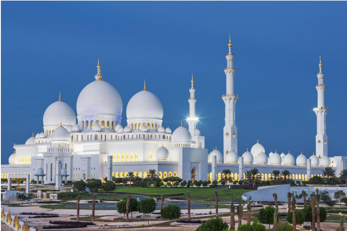
Sheikh Zayed Grand Mosque

Head to Underwater Zoo , located above the Dubai Aquarium where you see various marine life. While you visit through an underwater tunnel, you not just see marine life around you, but also above you with glass-bottom boat tours and mermaid makeovers.